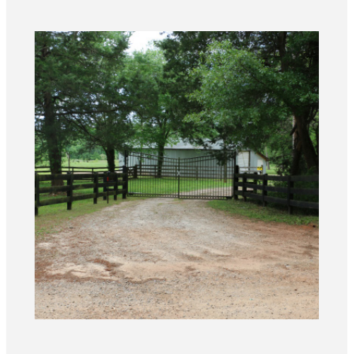
FOR SALE 179.71 ACRE RETREAT NEWBORN, GA